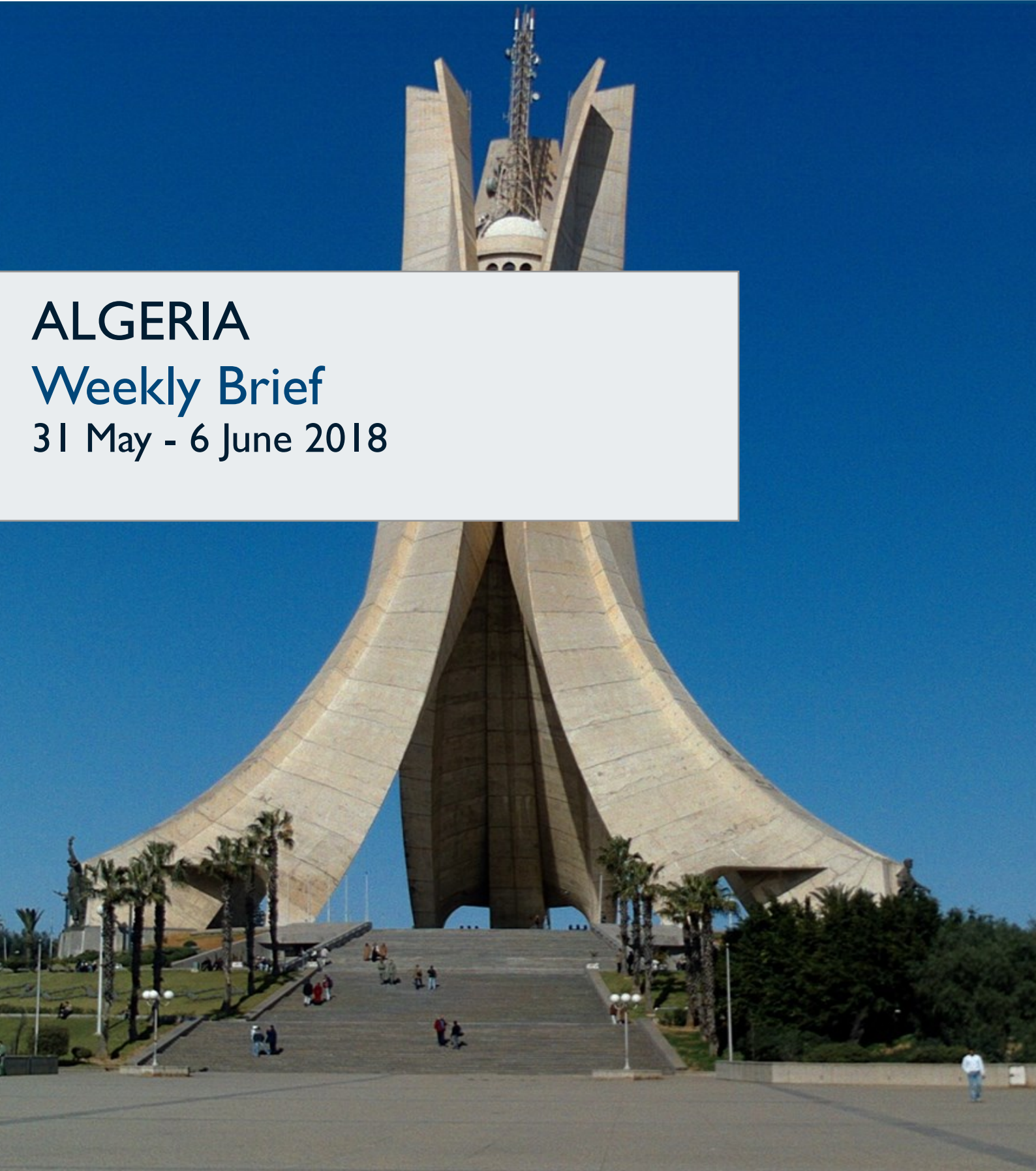
Monument of the Martyrs, Algiers